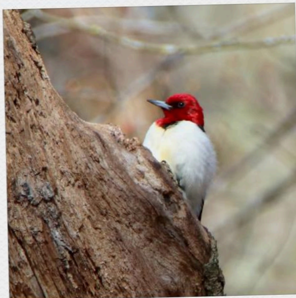
Red-headed woodpeckers made cameo appearances for eagle-eyed visitors!