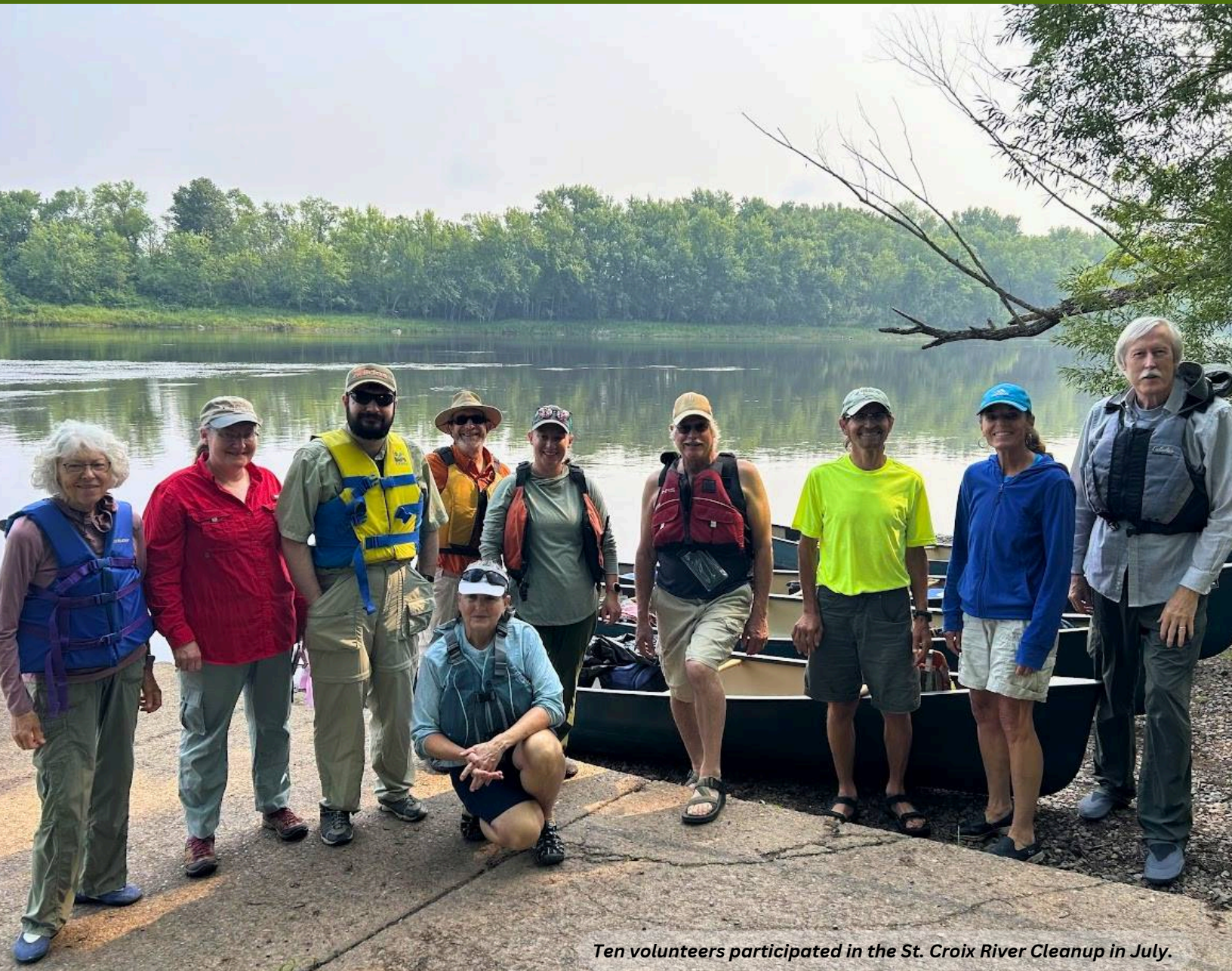
Ten volunteers participated in the St. Croix River Cleanup in July.

A community organization devoted to preserving and enhancing the experience of Wild River State Park Summer 2025