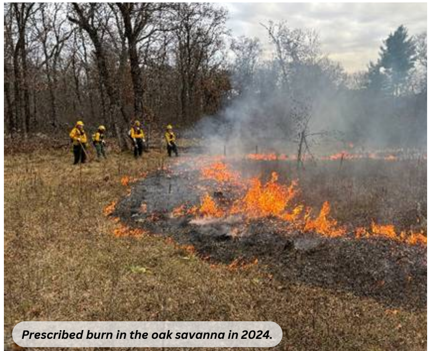
Prescribed burn in the oak savanna in 2024.

Wild River is undertaking a 10-acre oak savanna restoration, which happens to be a beloved plant community for red-headed woodpeckers. It's also rare, covering only about 1% of its historic Minnesota range. They nest in dead tree cavities and “fly-catch” insects in the open understory. Next time you come to the park, look for them from the main park road between the trail center and visitor center turnoffs. During the summer, we'll be offering Woodpecker Walk & Talks and evening programs about woodpeckers and oak savannas. These will be on the park's event calendar.