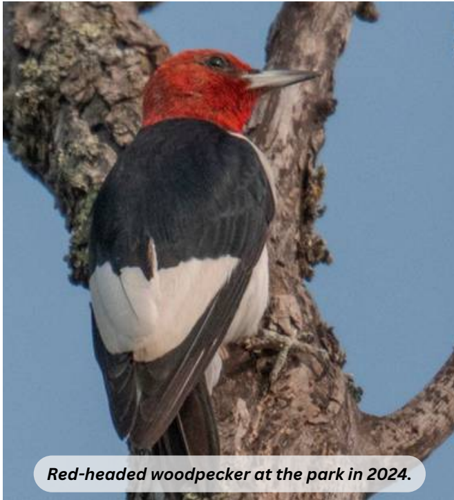
Red-headed woodpecker at the park in 2024.

In 2024 we celebrated black bears. This year our focus shifts to the lives of woodpeckers. Seven distinct species can be found at Wild River State Park. How many can you name? (See answer at the end of this article).