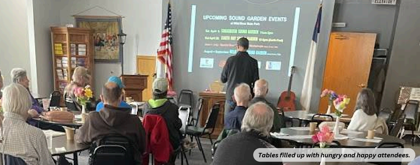
Tables filled up with hungry and happy attendees.