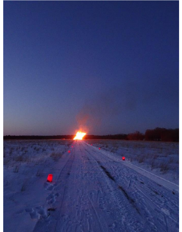
Last year's Candlelight Night bonfire.

As in the past, there will be a huge bonfire (bigger than a house, lit at 5:45 p.m.), an astronomer with a huge telescope (if a clear sky), entertainment, cookies, cider, hot chocolate, and coffee. Tuck a few bucks in your snowshoe/ski togs for a free will offering to help out the Friends of Wild River State Park to fund this event as well as other events. And remember, a vehicle park permit will be required to enter the state park for this event. Permits can be purchased at the park's front office.